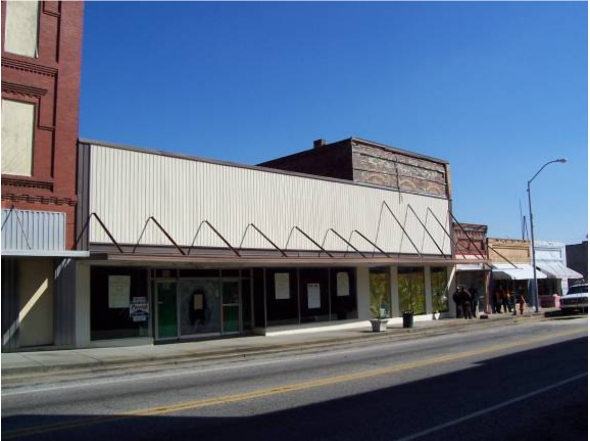
Old Pope's Dime Store/Super 10 Building